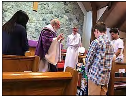
March Food Collection is blessed and delivered.