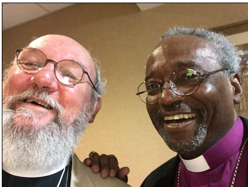
Selfie with Presiding Bishop of the Episcopal Church, Michael Curry at a pre-General Convention meeting in Martinsburg, WV May 2018.