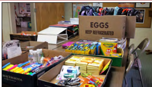
Some of the supplies from last year's collection.

These items will be distributed to Hempfield students through the Landisville Food Pantry.