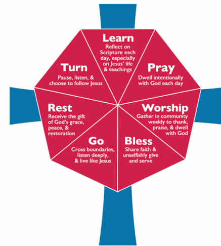
THE WAY OF LOVE Practices for Jesus-Centered Life

Read Luke 1-2. Give thanks for the birth of the Christ-child. Pray that you may follow Christ Jesus on his Way of Love with your whole heart, mind, body, and spirit.